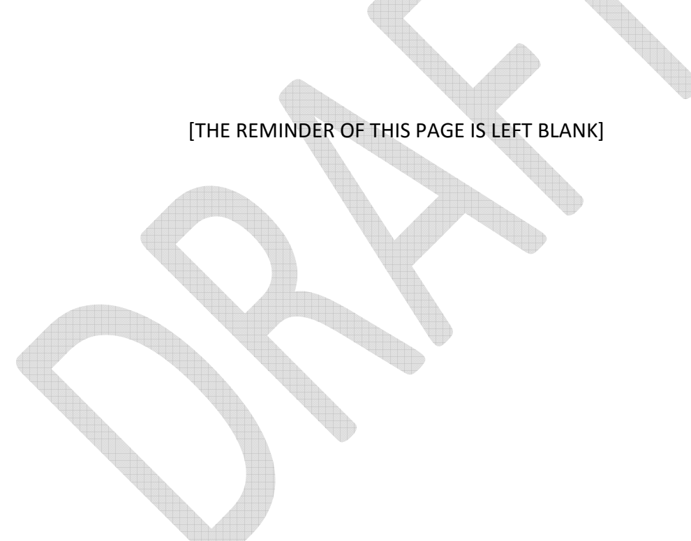
EXHIBIT E Roadway Easement See Attached