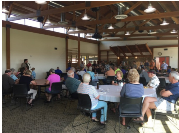
Open House Celebration – June 2, 2017