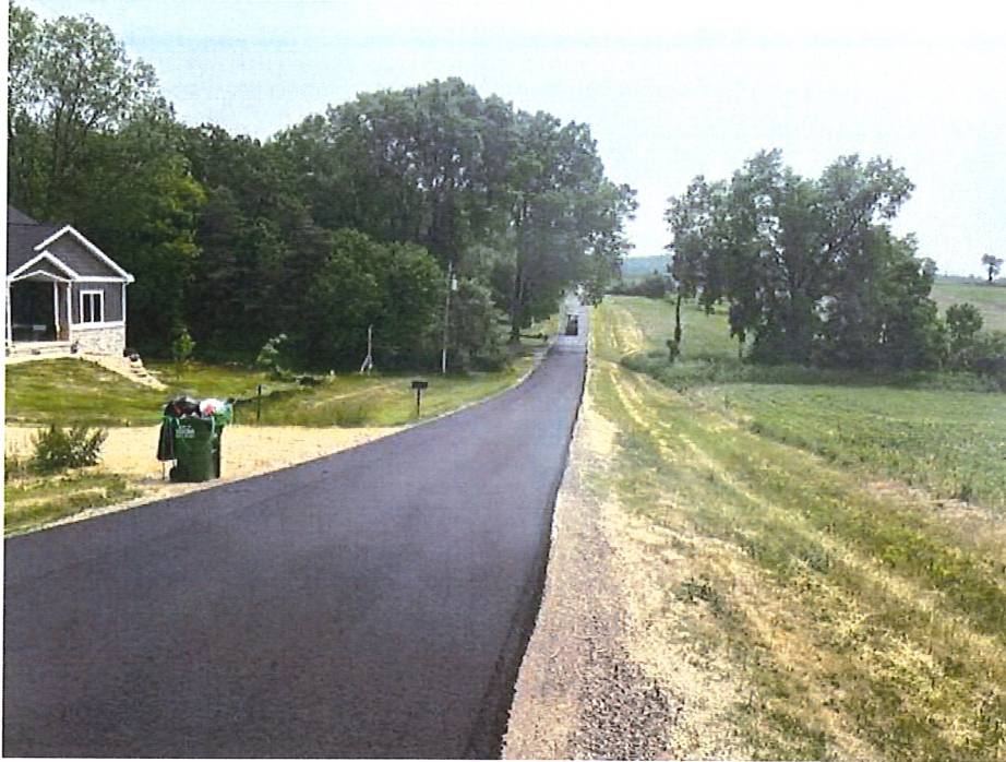
Red Stone Lane